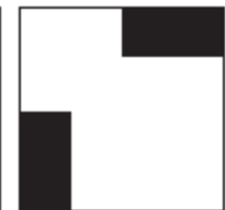
1/8 Page H: 5.25 X 2.515 1/8 Page V: 2.563 X 5.135