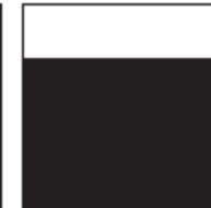
1/4 Page Horizontal 10.626 x 7.76