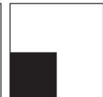
1/4 page Box 5.25 x 5.135