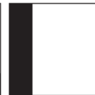
1/4 Page Vertical 2.563 x 10.4