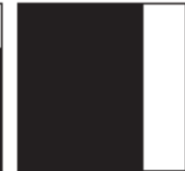
1/4 Page Vertical 7.94 x 10.4